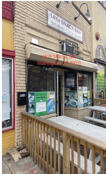
5. 3/24/22 4616-18 14 th St NW