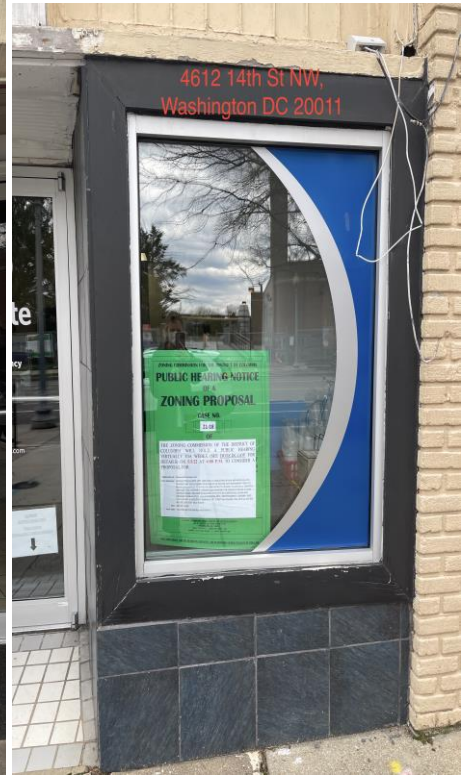
3. 3/24/22 4612 14 th St NW