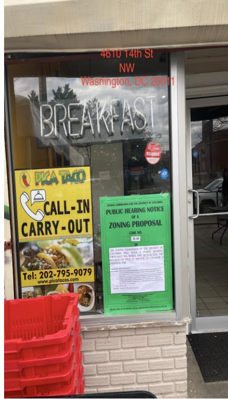
2. 3/24/22 4610 14 th St NW