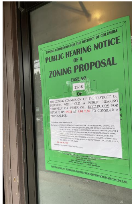
6. 3/24/22 4618 14 th St NW