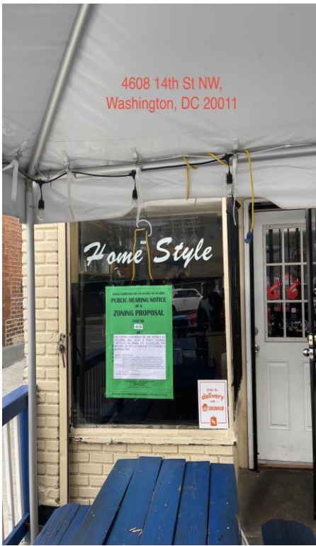
1. 3/24/22 4608 14 th St NW