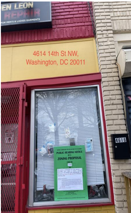
4. 3/25/22 4614 14 th St NW